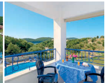
Location of Rodanthi Apartments (arrowed)