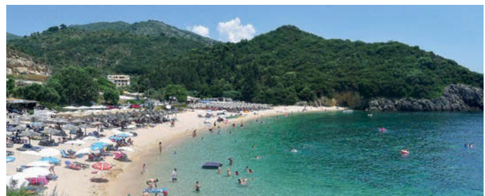
Mega Ammos beach

The Apartments: Swimming Pool Bed & Breakfast Air Conditioning Apartments for 2/4 Free WiFi