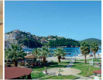
View from Evanti