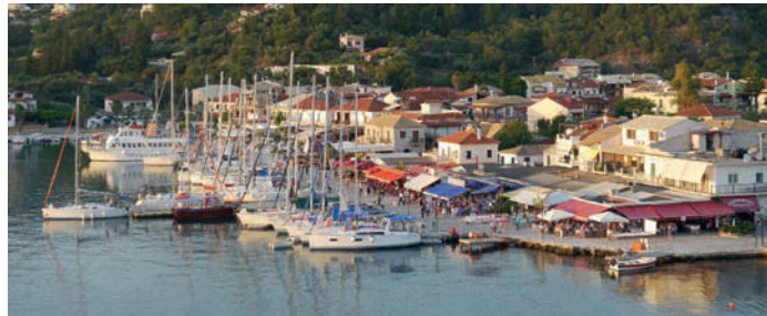
Sivota view from Filakas