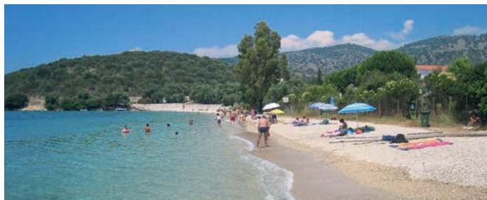
Galikos Malos beach is a 5 minute walk from the harbour

The Hotel: 3 Stars Plus Bed & Breakfast Air Conditioning Free WiFi