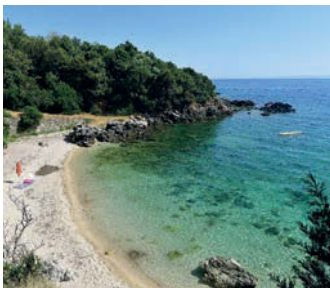
Beach near Paxos View

This is a hilly location, with a fair few steps down from the top entrance, and car hire is recommended. However the supermarkets will deliver and a taxi back from the harbour costs c €7.